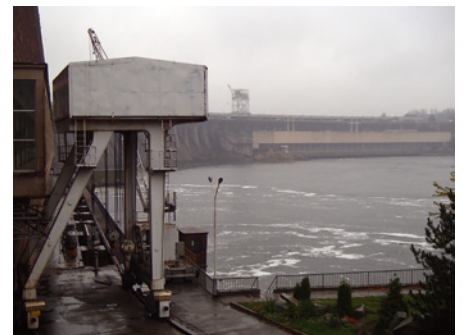
DniproHES, a hydropower station on the Dnipro River in Zaporizhzhia, 1927-1932.