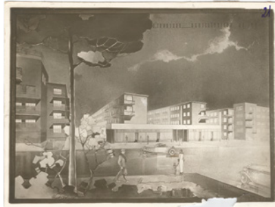
Perspective image of the residential district in Gorlivka (Donbas), 1930s.

will the entire state's architectural and construction system have to be recreated from the ground up? This paper will outline the history of DIPROMISTO from 1930 to the present day and raise a series of relevant questions about its place in Ukrainian history and its potential future.