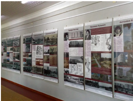
Main hall of the exhibition.

The exhibition (June 2023) was dedicated to female architects' contribution to Rivne's environment formation in the 1960s-1980s. As in other cities of Ukraine, under the conditions of total typification, the work on the spatial planning composition of new urban districts remained the only tool for creating expressive urban landscapes. Criticized for their