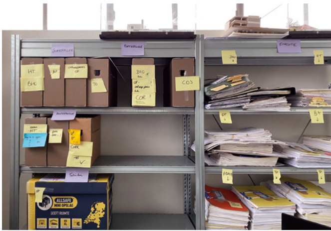
03 The archive involved various types of hard copies to be processed.

In an effort to downsize the archive, it was considered to identify duplicate documents, comparing process-related with building-related files, and perhaps discard the duplicates in the meeting reports. The archivists disagreed since splitting up these reports may have made the documents meaningless, whilst these meetings were crucial in the decision-making process with direct implications on the design choices and interventions. Upon consideration, it was decided to keep the reports in their entirety, as a 'customised' solution. An additional list indicating in which reports certain buildings are addressed allows searches by sub-project.