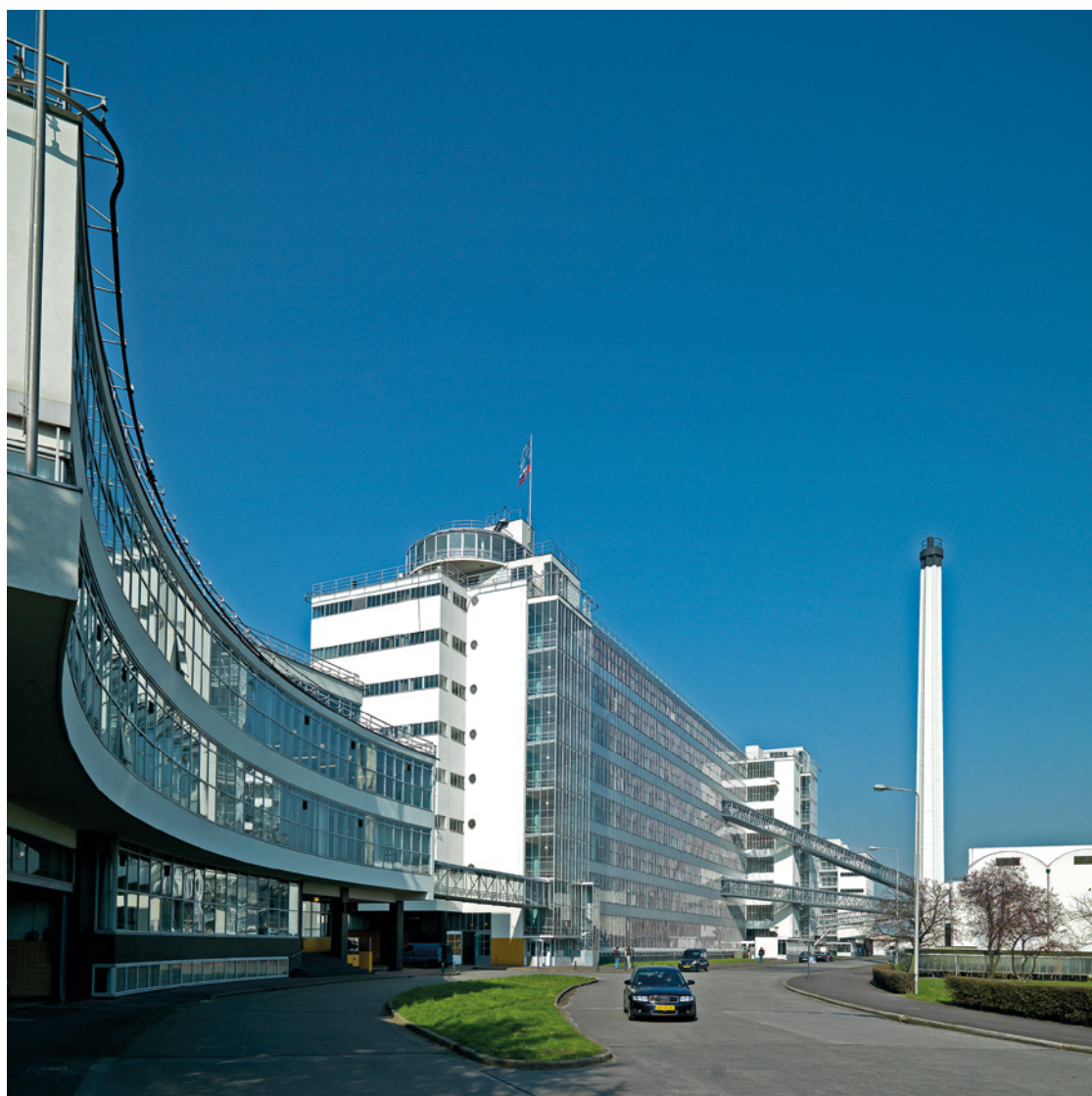
01 Van Nelle Factory after conversion and conservation.

KEYWORDS: Van Nelle Factory, Rotterdam City Archive, documentation, archival challenges, redevelopment.