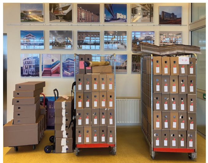
05 Re-organized documentation before shipment to the archive.

In addition, the Van Nelle redevelopment archive included a huge amount of digitally-created material, such as CAD drawings, e-mails, digital reports and so on. This