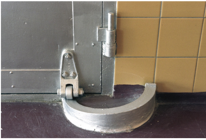
06 Example of the photographic documentation in the archive, showing the 'automatic' self-closing mechanism of a fire door.

resulted in a diversity of document types that have been transferred ranging from paper and blueprints to floppy disks and CD-Roms. Digital documents were transferred from the architect's digital archives to external hard-drives and handed over for further processing by the City Archive. 5