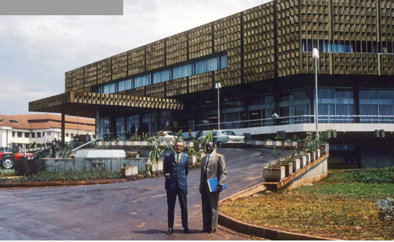
03 International Conference Centre. 1970s.