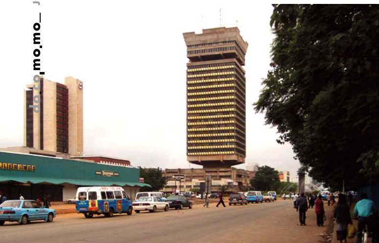
05 FINDECO House in Lusaka, Zambia.

island in Lake Victoria, simulating a battle to conquer Cape Town, South Africa.