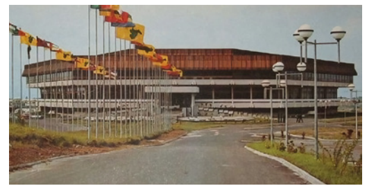
12 a, b: Palais de Conférences by Energoprojekt in Libreville, Gabon (super resolution and rectifying by author).