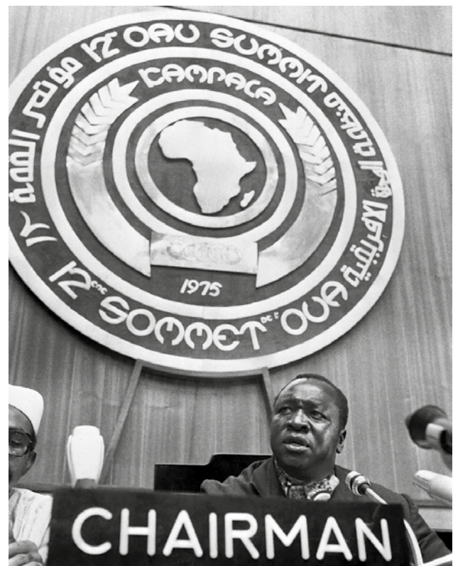
02 Amin as Chairman of the OAU.

The OAU Heads of State Summit in Kampala, Uganda, held from July 28 to August 1, 1975, was a significant event (The National Archives, 2009, [FIGURE 02]). Prominent figures such as Yasser Arafat, Muammar Gaddafi, Muḥammad Anwar Sādāt, and Yakubu Gowon attended the conference. Drama ensued during the summit, with Yakubu Gowon overthrown by a coup d'état back in Nigeria (Reuters, 1975). At the summit's conclusion, the Ugandan Army held a mock air and sea assault on an