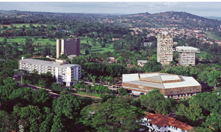
04 International Conference Centre next to Nile Hotel, now Serena Hotel. 1970s.