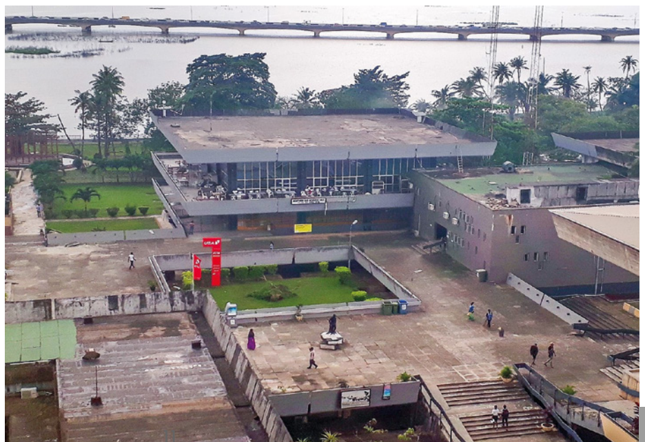
04 Aerial view of UNILAG academic core with the old dining Hall at the centre (currently a Natural History Museum and library extension).

such as the Freedom Square at the University of Nigeria, named after the 1962 protests. This spatial dimension to student activities on campuses was most apparent in University of Nigeria 1960-1985 , which contained the accounts of pioneer students [FIGURE 04].