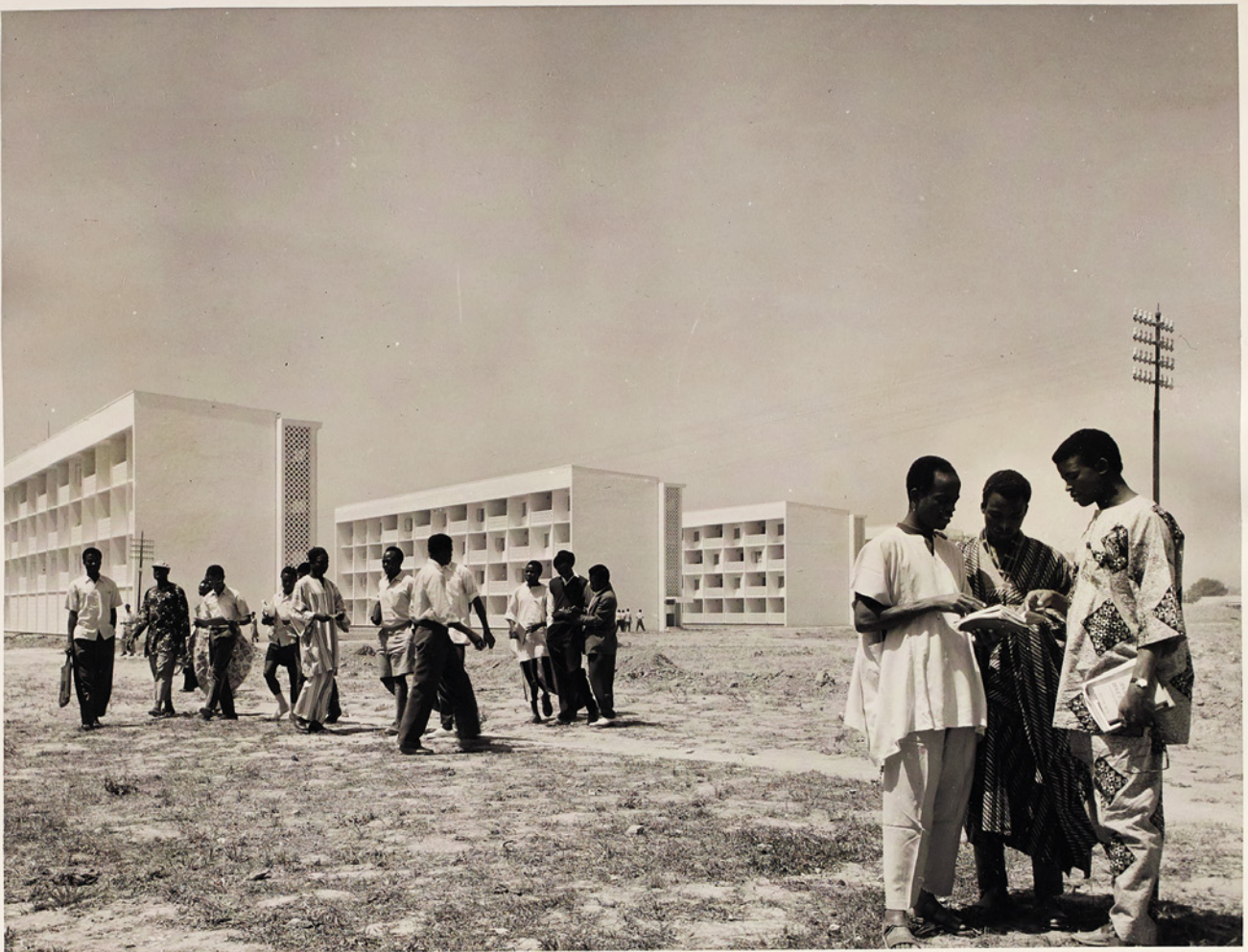
03 Student halls of the defunct Nigerian College of Arts Science Technology, Zaria, currently the Ribadu and Alexander Halls, Ahmadu Bello University.