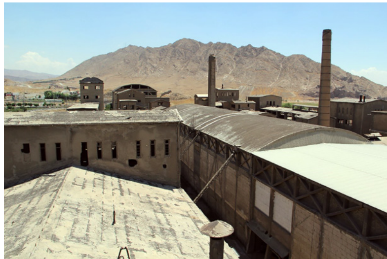
04 Tehran - The Rey Cement Factory.