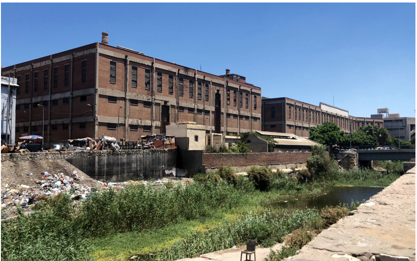
01 Alexandria - The former SGPD (far right) and its adjoining warehouse block with their bare functionalist architectural expression. The building was renamed to Miṣr Cotton Press post-nationalization. View north.

In 1959, the Egyptian Government signed a contract with the West German company Klöckner-Humboldt-Deutz AG to supply trucks and buses (Kaiser & Steinbach, 1981). This resulted in the foundation of NASCO (El Nasr Automotive Manufacturing Company) in 1961 in