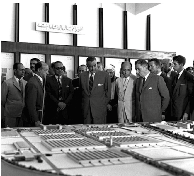
02 Helwan, probably 1960s. Former Egyptian President Nasser views the NASCO site complex model during its inauguration. The model depicts the large-scale complex with its single-story factory halls © Collection Bibliotheca Alexandrina.

The historical background of the Rey Cement Factory dates to the beginning of the 20 th century and the industrial development plans of the first Pahlavi era. A key argument for establishing the Rey Cement Factory was independence from Russia and the expensive Russian cement imports financed by the state. However, due to an agreement between Britain and Russia, the progress of the project stalled. Eventually, it was a German consortium including Sika, Siemens, and others that helped Iran build its own cement factory in the 1920s, in line with Germany’s foreign policy which identified Iran as a supplier of key raw materials (Jenkins, 2016). From 1925 to 1941 a German project coordinator oversaw construction work done by the Danish company FLSmidth, which