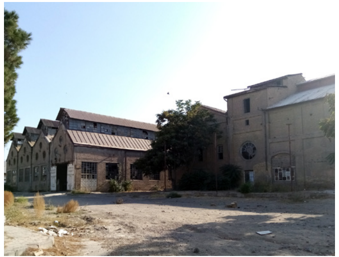
03 Mashhad - The Mashad Textile Factory with its gable roofs of the production halls and unadorned walls. © Sheikholeslami, 2021.

in turn employed Italian workers [FIGURE 04] (Fateh 2021). Schünemann was responsible for later extensions and redesigned the older parts based around new equipment supplied by Siemens. One of the buildings was named after Walter Gropius. It is noted as being designed by him in the style of Neue Sachlichkeit and, as such, differs architecturally from the other buildings. The building remained operational until 1984, when production was halted. Due to the pollution crisis in Tehran, the plant's poor environmental performance was deemed unsustainable. In 2019, the municipality of Tehran decided to preserve the site. This was a direct result of the campaign by TICCIH Iran, DOCOMOMO Iran, and the MHFL Research Hub. The visit to the factory by the German ambassador and the mayor of Tehran in May 2019 might be seen as a turning point for a joint future and adaptive reuse is being discussed for this significant monument.