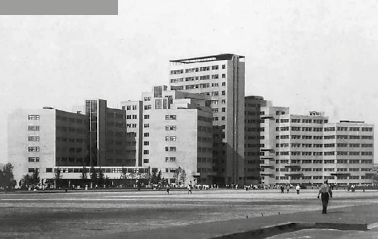
08 The House of Projects, arch. Serafimov S., Zandberg-Serafimova M., 1931-32.