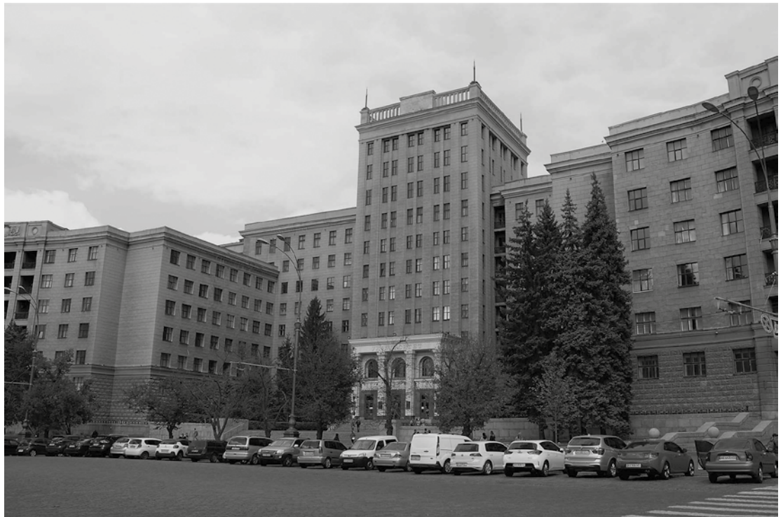
13 North Building of Karazin University © Mariia Rusanova, 2019.

lost (Protsenko, 2012). Just like the House of Projects, the hotel after the war was rebuilt in another, classicizing post-war style. The difference was that this building was restored by its author, Grigory Yanovitsky, once the head of Ukrainian Constructivists (Bouryak & Rusanova, 2020). He has changed and simplified the shape of the lower floors, enlarged the ledge of the crowning cornice and built a new, larger and more expressive entrance portico. After restoration the hotel (now the hotel "Kharkiv") has received a new architectural expressiveness, but has become a monument of another architectural era [FIGURE 11]. In 1976, a 16-storey building was added to the main building of the hotel. In 2008, another reconstruction of the hotel was carried out, but already as an architectural monument of the 1950s. Today, its appearance is considered one of the hallmarks of the city of Kharkiv, and only the well-disguised composition of the volume of the building reminds us of the style of the capital period.