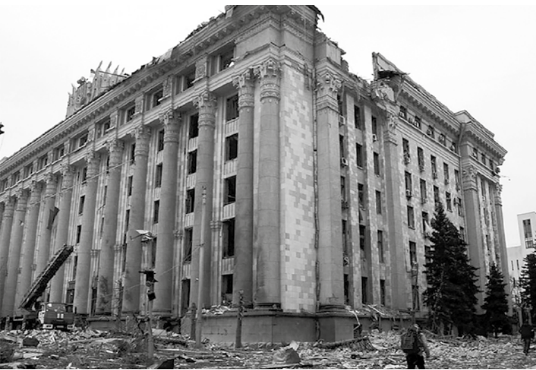
02 The building of the Kharkiv Regional State Administration after the bombing.