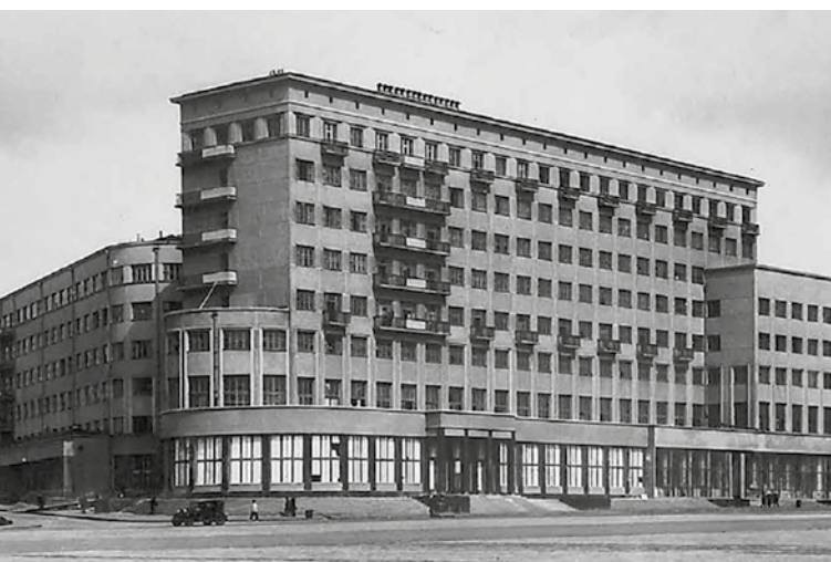
10 Hotel "International", arch. Yanovitsky G., 1932-36.

Hotel "International" was also burned during WWII, lost its roofs and glazing. The famous interiors, which in 1937 at the world exhibition in Paris received the Grand Prix of the Architecture section, were completely