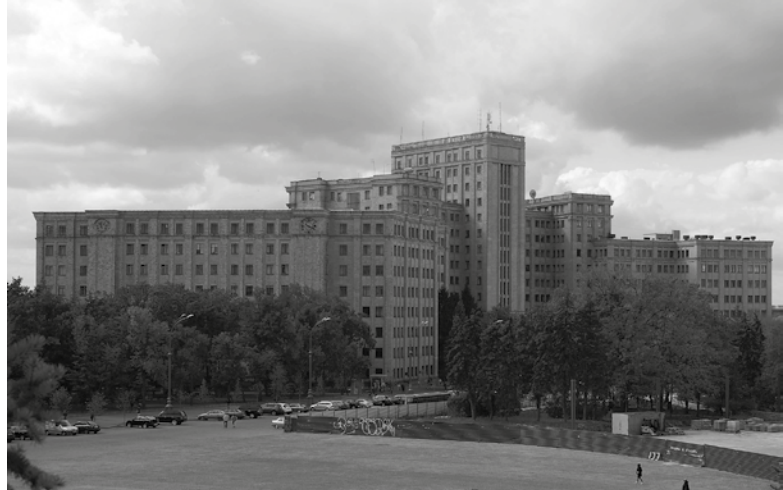
09 Kharkiv National University named after V.N. Karazin (was opened after reconstruction in 1957).

four transparent prisms, especially spectacular in the evening hours. The soaring visor was removed from the central tower; therefore, its height was reduced, and the overall dynamics of the spatial composition was weakened.