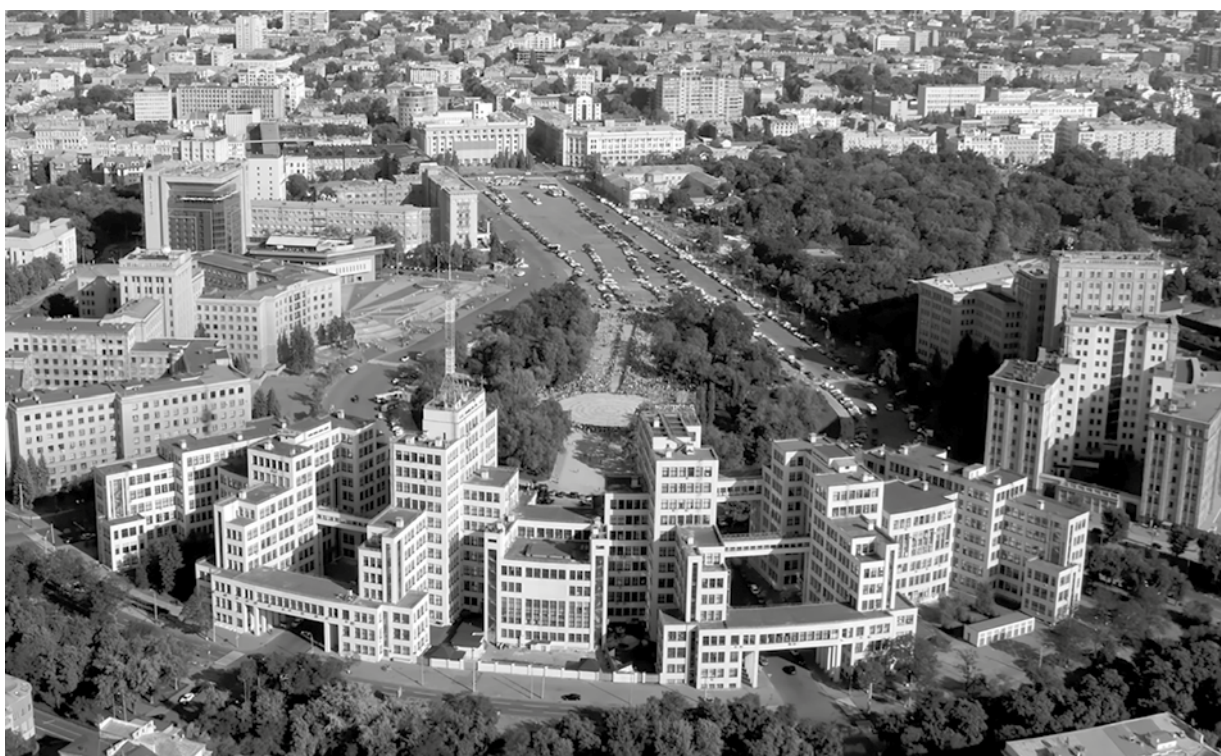
01 Freedom Square (the former Dzerzhinsky Square) in Kharkiv. In the foreground (from left to right): North building of Karazin University (former House of Cooperation), Derzhprom, Karazin University (former House of Projects), at the far end of the square - the building of the Kharkiv Regional Administration, on the left at the bend of the square - the Kharkiv Hotel building (former International).

KEYWORDS: Kharkiv constructivism, Avant-garde, Ukrainian Modernism, monument protection