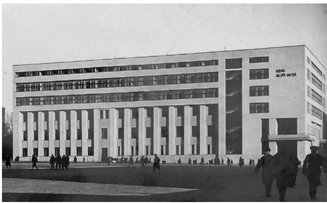
04 The Central Committee building of the CP(b)U (1929-32, architect J. Steinberg). © Photo from the authors archive, 1930s.