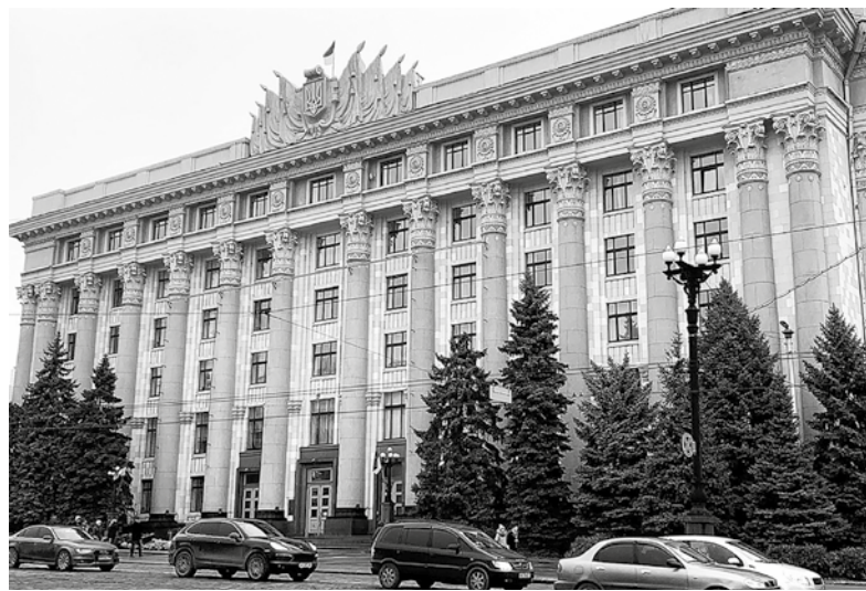
03 The building of the Kharkiv RSA (architects V. Kostenko, V. Orekhov) before the shelling.

INTRODUCTION: The government center on Freedom (Svoboda) Square [FIGURE 01] (the former Dzerzhinsky square) in Kharkiv, Ukraine, was mostly completed in the 1930s. At that time, it was the world's largest, unique, integrated architecture complex of early modernism – its outline can fit the complex of the Roman Cathedral of St. Peter four times and twice the palace in Karlsruhe. The complex of Freedom Square included the gigantic buildings of the House of State Industry (Derzhprom, 1931), the House of Project Organizations (1932), the House of Cooperation (from 1929, it was not completed until the outbreak of World War II), and the Party Central Committee (1932). In addition, the "International" Hotel (1936), the largest in Ukraine at that time, was erected on the square (Khan-Magomedov, 1996).