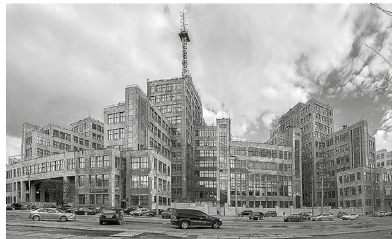
07 The House of State Industry before reconstruction. © Photo from archive of A. Bouryak, 1990s.