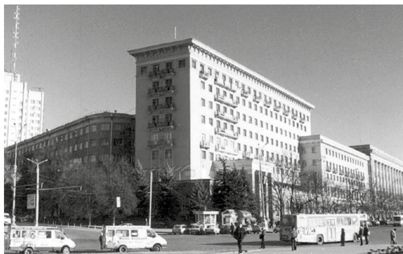
11 Hotel "Kharkiv", reconstruction by arch. Yanovitsky G. © Photo of the 1990s, the authors archive.