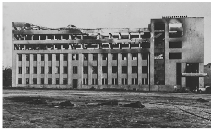
05 The building of the Central Committee during WW2. © Photo from the authors archive, 1944.

provincial zemstvo (1900, architect A. Minkus), and a three-story mansion (1914, architect V. Velichko) attached to it. The resulting volume was built on three more floors receiving a large-scale “forehead”, made in the best traditions of functionalist architecture, and expanded to the intersection of Sumska and Veterinary (now Svoboda) streets [FIGURE 04]. The main entrance to the new huge building was arranged on the corner of these two streets. Thanks to its simple and expressive modernist shape, it confidently completed the composition of the rectangular part of the square. A unique research development, undoubtedly innovative for its time, was lost from another missile strike, now only photographs and J. Steinberg’s paper (Steinberg, 1931) remain from the building.