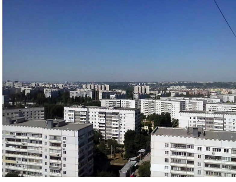
12 Saltovka residential area in Kharkiv. Modern look.

The architectural avant-garde embodied the idea of a machine paradise in "universal planning", Corbusier's five principles: house on pillars, strip glazing, universal plan, horizontal roof and roof garden, which were realized from Alaska to Australia and from Russia to the USA with kilometres of monotonous reinforced concrete panel standard houses and micro-district settlements that do not notice either a person, or a place, or time. In fact, this was the new language of modernism. Mies van der Rohe said that "Language can be used for everyday needs like prose if you can speak very well - like great prose. And if you really speak well, you can be a poet. But in all cases it is the same language, and its character remains the same,