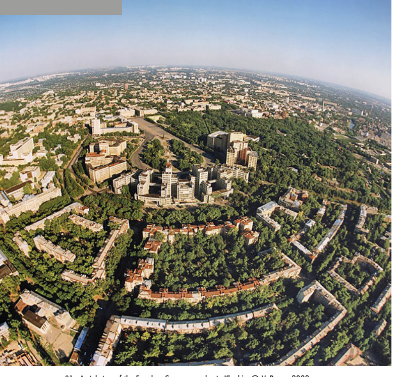
01 Aerial view of the Freedom Square complex in Kharkiv.