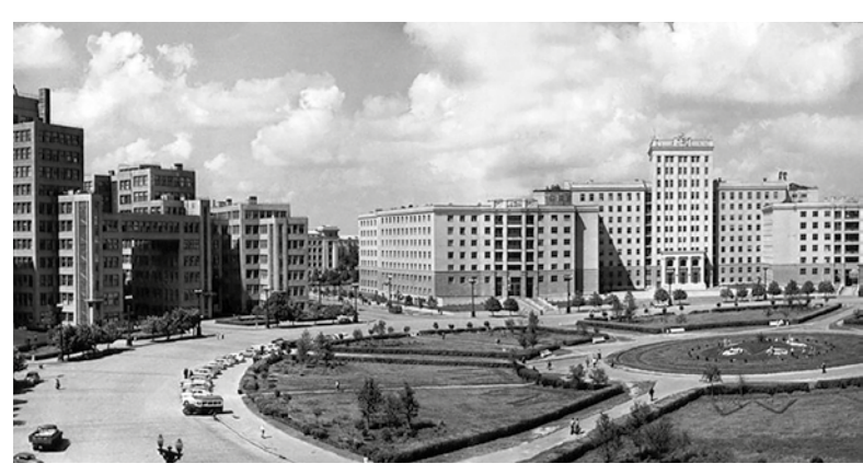
House of Cooperation in Kharkiv (on right), project 1928, architects A. I. Dmitriev, O. R. Munts, construction began in 1933-35, rebuilt after the Second World War. Photo from the early 1950s.

in space, contrast of large glass planes and blank wall surfaces, dynamic compositions became the characteristic features of the new code (not only in Kharkiv, but the whole constructivist one) as well. All these features were possessed by buildings created in Kharkiv in the 1920s to the early 1930s by members of the Moscow OSA - the society of contemporary architects - or Ukrainian OSA, established in 1928 (Society of Contemporary Architects of Ukraine, 2023). Among them are the hotel "International" on Dzerzhinsky Square, (1931-34, architect G. A. Yanovitsky, the member of the OSAU (Yanovitsky, Grigory Oleksandrovich, 2023), (Kharkiv (hotel), 2023), a group of buildings on Rudnev Square – now Square of Heroes of