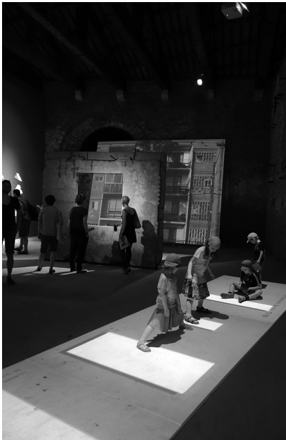
03 Monolith Controversies . Chile Pavillion, Arsenale .