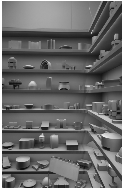
04 Fair Enough: Russia's Past, our Present, Russia Pavillion, Giardini.