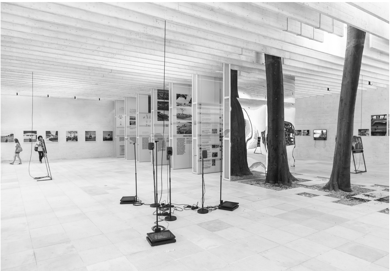
08 Forms of Freedom: African Independence and Nordic Models . Nordic Countries Pavillion, Giardini . © Alexandre Delmar, 2014.