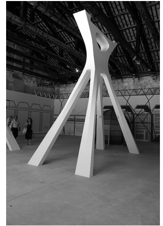
07 Acquiring Modernity , Kuwait Pavillion, Arsenale .