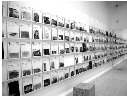
01 Office US. USA Pavillion, Giardini.

The curator's statement argues that France has shaped modernity since 1914. The exhibition succeeds at expressing modernism as a complex reality by representing its great expectations and ultimate disillusion. From Jacques Tati's comedy to the tragedy of Drancy internment camp, France's discourse aims at epitomizing the Modern Movement itself.