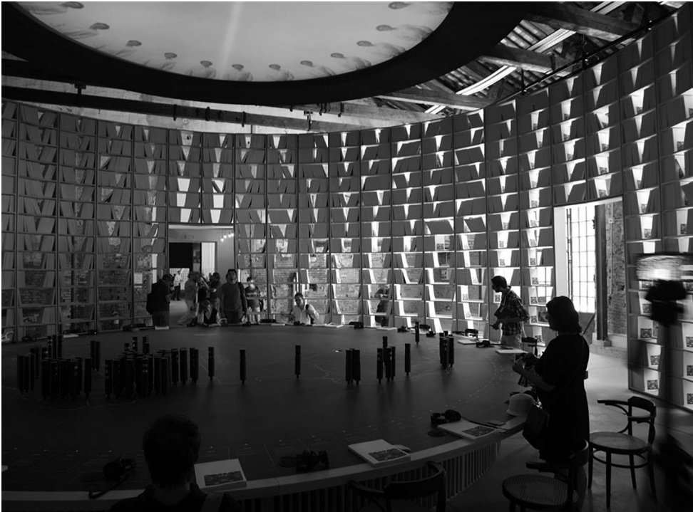
06 Fundamentalists and Other Arab Modernisms . Kingdom of Bahrain Pavillion, Arsenale .