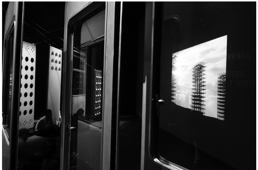
02 Modernity: Promise or Menace? France Pavillion, Giardini .

Unwritten stands as an effort for starting a comprehensive survey on Latvia's recent architectural output. The exhibition develops a work-in-progress database performed by a bright installation. The collected examples of Latvian 20 th -century architecture are presented in paper sheets hanging from the ceiling, which will continue to be piled up throughout the months of the Biennale .