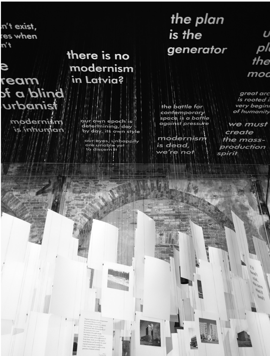
05 Unwritten . Latvia Pavillion, Arsenale .

Other post-socialist societies are dealing with similar challenges but using distinctive approaches to display their recent architectural past. Armenia, for instance, exhibits The Capital of Desires using Yerevan's modernism to represent the Soviet Armenian era. Russia shows Fair Enough , which is an original exhibition using the universal manners of a trade fair to advertise Russian modern ideas. According to the jury, the Russian Pavilion received a Special Mention "for showcasing the contemporary language of commercialization of architecture".