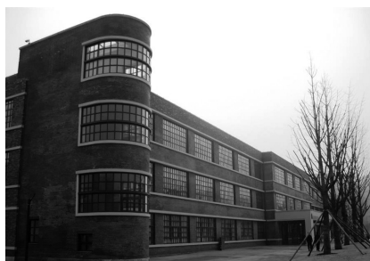
01 National Museum of Modern and Contemporary Art, Seoul.

The conference itself, between 25 and 27 September, took place in the recently-renovated National Museum of Modern and Contemporary Art, Seoul. The museum is a modern extension and renovation of the old Kimusa Military Hospital, built in 1928 during the Japanese occupation. Following that function, it was used as the Defense Security Command building during the tumultuous early days of democracy in Korea. The occasion to preserve its history and infuse it with modern cultural relevance was celebrated and inaugurated by the 13 th International docomomo Conference as its first major event.