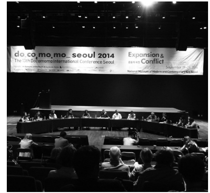
06 13 th International docomomo Conference. Round Table.

and Ana Tostões, called for the creation of a docomomo International Specialist Committee on Sustainability. Docomomo International challenges everyone interested in participating, to send to docomomo@tecnico.ulisboa their ideas and suggestions, before 6 January 2015.