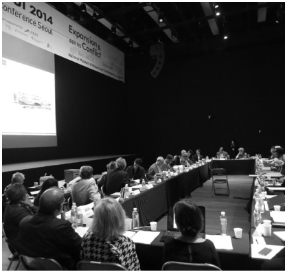
07 13 th docomomo Council Meeting.