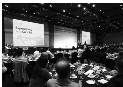
02 13 th International docomomo Conference. Opening ceremony.

About 80 papers were presented at three simultaneous sessions, during three enlightening days of discovery that were a huge success. Moreover, it was with great satisfaction that docomomo International and docomomo Korea published the Proceedings of the 13 th International docomomo Conference for distribution to all the participants in the first day.