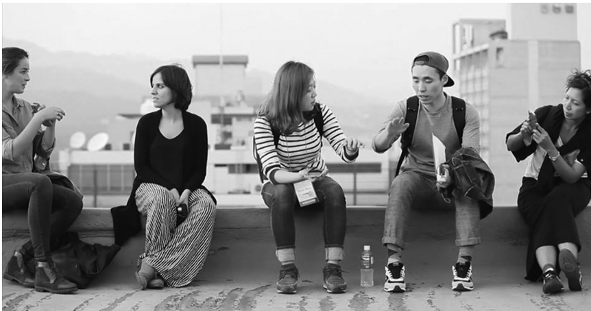
05 Team working in the roof of the Sewoon Arcade.