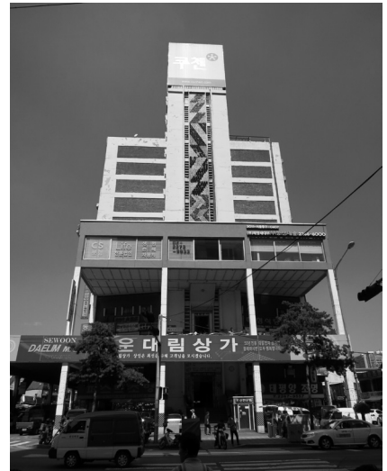
04 Kim Swoo-Geun, Sewoon Arcade, Seoul, Korea, 1967.