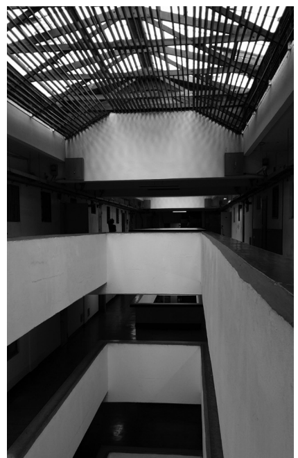
08 Kim Swoo-Geun, Sewoon Arcade, Seoul, Korea, 1967.