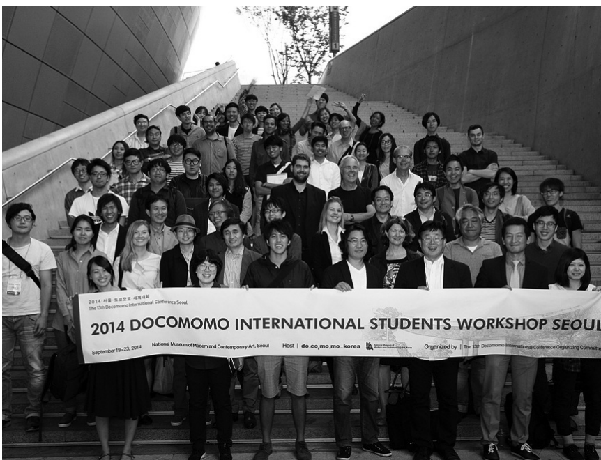
07 13 th International docomomo Workshop participants.