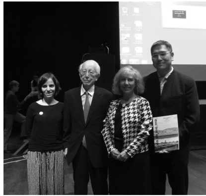
05 13 th International docomomo Conference. Fumihiko Maki with the editorial team of docomomo Journal 50.