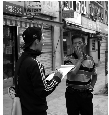
06 Student making interviews to an inhabitant of the Sewoon Arcade.