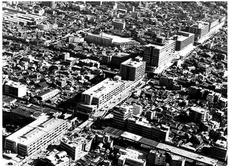
02 Kim Swoo-Geun, Sewoon Arcade, Seoul, Korea, 1967.