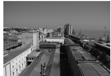
01 Manutenção Militar Complex (MMC), Lisbon, Portugal.