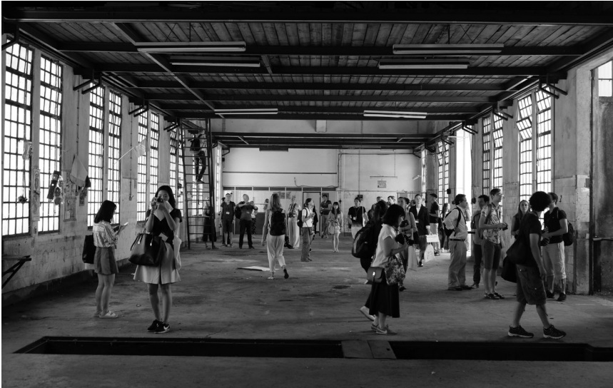
04 Workshop presentations and debates, Técnico – University of Lisbon.