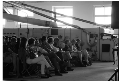
05 Opening session of the Workshop at MMC. © docomomo International, Leandro Arez, 2016.

The results included some common strategies came out among the groups, such as establishing masterplans along time and