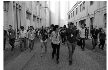
06 Workshop group site visit.

docomomo believes that the International docomomo Workshop is a tool contributing to a strategy for the future development of Lisbon's urban fabric and, as Hubert-Jan Henket stated at the 5 th roundtable " docomomo's 25 th +1 Anniversary, Time for Adaptive Re-thinking?", during the 14 th International