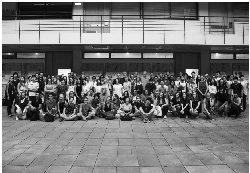
02 Workshop group photo.