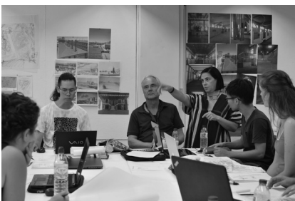
07 Workshop group work, Técnico – University of Lisbon.

More info: Official website http://www.docomomo2016.com/workshop CML movie report: https://vimeo.com/181969432