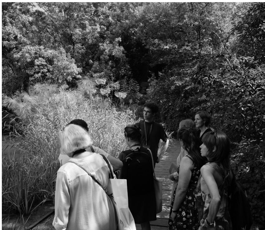
08 Tour to Calouste Gulbenkian Foundation.

It was my first participation in the Docomomo conference and to me it was an honour and pleasure to be at this event. (...) I could learn a lot from all the morning and afternoon lectures (the choice of lecturers and topics was absolutely fantastic) as well as from the presentations at the panel sessions. (...) Last but not the least - the venue of the conference i.e. the Gulbenkian Foundation is great and your tour gave a chance to see more of that!