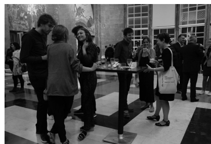
09 Closing party, Alcântara maritime station.