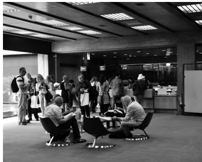
13 © docomomo International, Ana Beatriz, 2016.