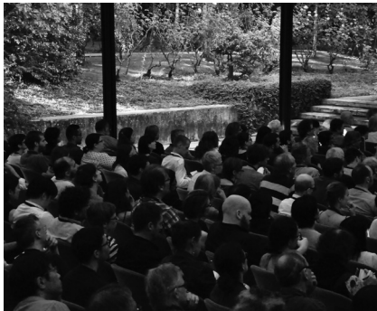
11 Morning keynote lectures, auditorium 2.

We would like to thank you and congratulate you for organizing a fabulous intellectual and social event in Lisbon. We enjoyed stimulating papers and discussions, and of course your great hospitality and lovely city.