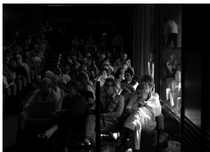
06 Morning keynote lectures, auditorium 2.

Just to say a huge thank you for the conference in Lisbon. I know everyone from Australia really enjoyed it too. It was really terrific, and I especially valued some of the keynote contemporary practitioners, who were so refreshing in their work with adaptive reuse. They will make great exemplars in my teaching.