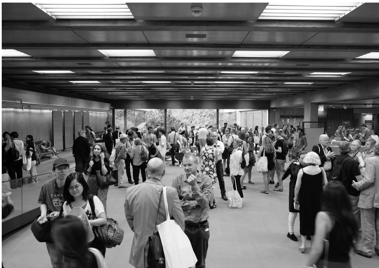
02 Conference opening day. © docomomo International, Leandro Arez, 2016.