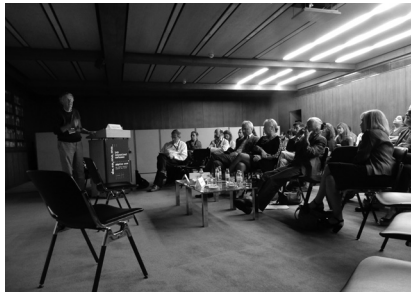
04 Roundtable Docomomo's 25th+1 Anniversary, Time for Adaptive Re-thinking?

In addition to the thematic choice, the form of participation was excellent in allowing a greater range and connection with research developed in all the continents, it was excellent. I'm sure that the coordination by this team for another two years will bring even greater accomplishments.