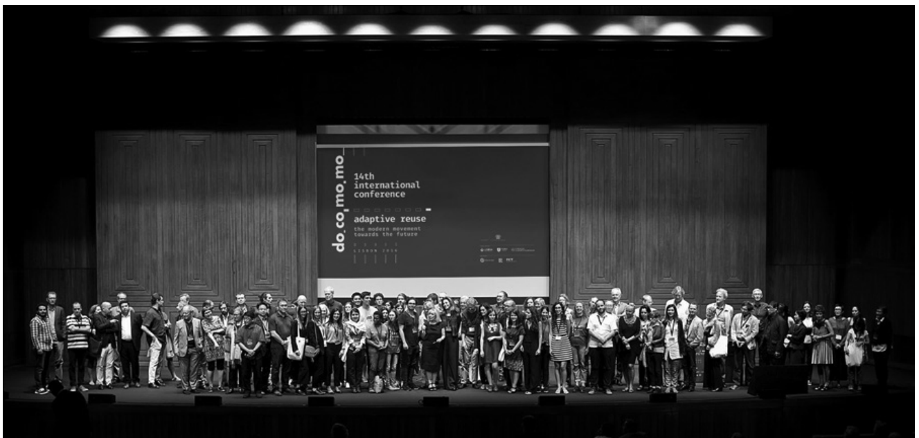
12 Group photo, closing session, main auditorium.