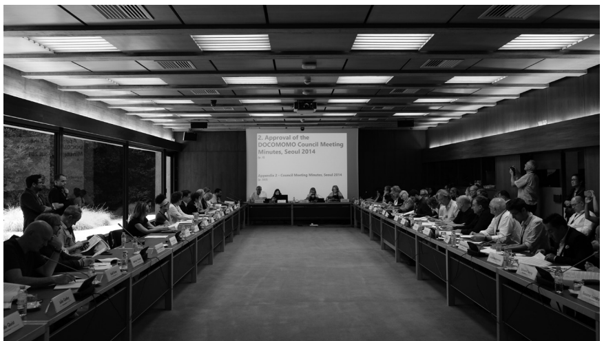
05 Council Meeting.

The organisation of the Conference was meticulous and the venue superb – I offer congratulations to you and all your colleagues for such a splendid and successful event which will be “a bard act to follow”! I am still working through the stupendous tome of collected papers with the greatest of interest and catching up with the various sessions I was unable to attend personally. It represents an enormous investment of intellectual capital.