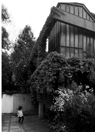
04 Emilio Duhart, PDVN 0458 house, Santiago, Chile, 1963-1966. Main entrance covered in creepers, 2017.