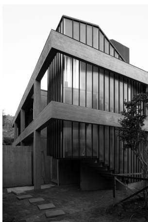
07 Emilio Duhart, PDVN 0458 house, Santiago, Chile, 1963-1966. Exterior after repair, entrance and staircase detail, 2021.