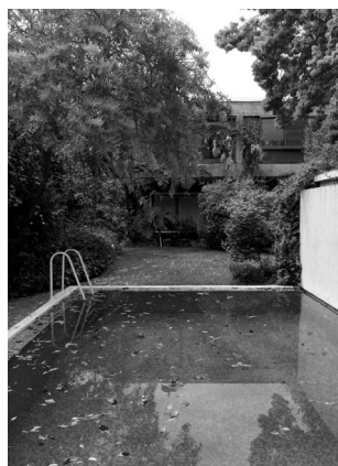
05 Emilio Duhart, PDVN 0458 house, Santiago, Chile, 1963-1966. Rear garden facade, 2017.