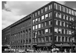
19. Academic Bookshop Alvar Aalto 1962