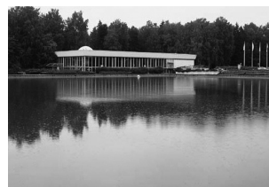
4. Tapiola Baths Aarne Ervi 1965