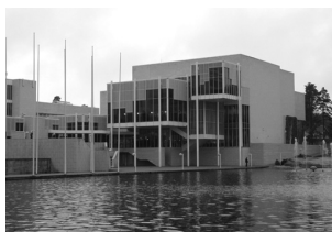
1. Espoo Cultural Centre Arto Sipinen 1989