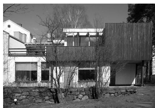
10. Studio in Munkkiniemi Alvar Aalto 1956