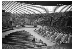
16. Tempeliahaukio Church Timo & Tuomo Suomalainen 1969