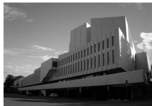
15. Finlandia Hall Alvar Aalto 1967-1971