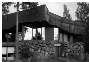
7. Dipoli Kongressikeskus Reima & Raili Pietilä 1961-1966