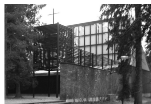
8. Otaniemi Chapel Heikki & Kaija Siren 1957