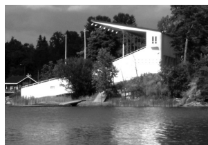
11. Töölö Rowing Stadium Hilding Ekelund & Alpo Lippa 1940