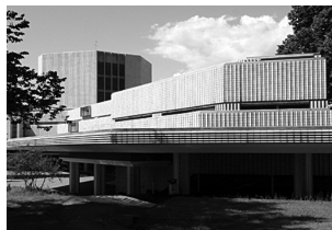
14. City Theatre Timo Penttilä 1959-67