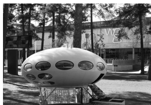
2. Weilin&Göös Printing Plant - WeeGee Aarno Ruusuvuori 1964-1974