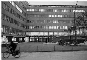
17. Portania Aarne Ervi 1957