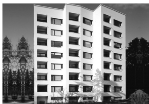
9. Housing Buildings Alvar Aalto 1962-1967