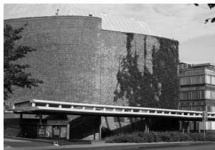
13. House of Culture Alvar Aalto 1955-1958