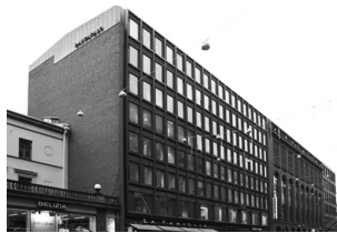
18. Rautatalo Alvar Aalto 1951-55