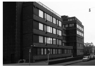
National Pensions Institute Alvar Aalto 1952